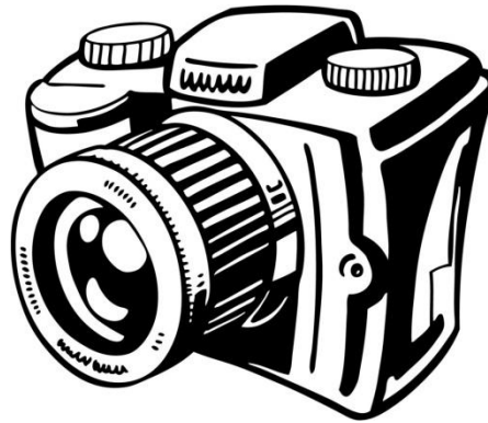
Photo Documentation can be achieved through a dedicated company, the General Contractor or the Architect.

Photo Documentation is the picture or video taking of the project at a point in time.