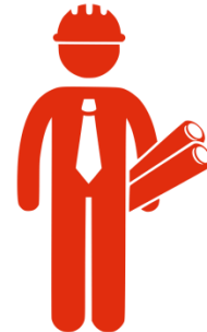
Photo Documentation is recommended before the start of construction of a project.