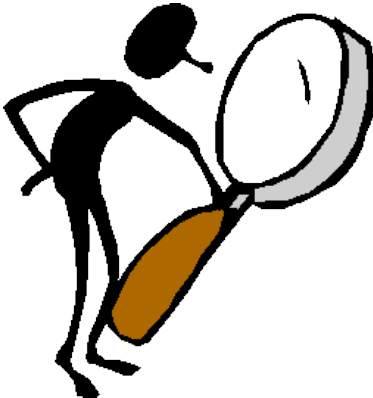
Photo Documentation can record the overall progress of a project from start to finish.

Photo Documentation is a method to look at construction items hidden by other built objects.